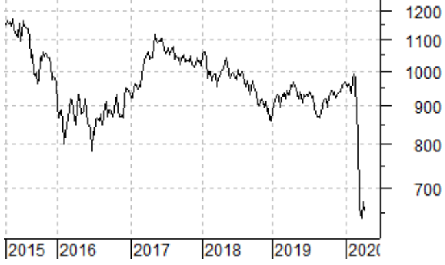
(Continued on Page 8)